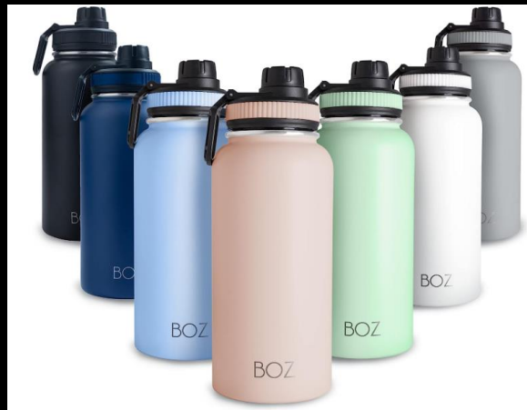
Stainless Steel bottles