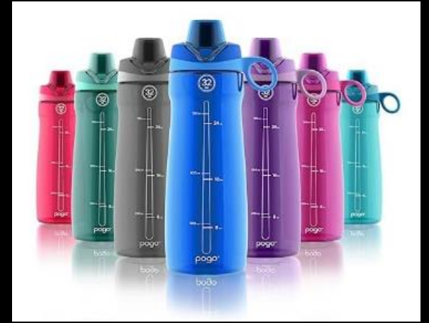
BPA free plastic bottles